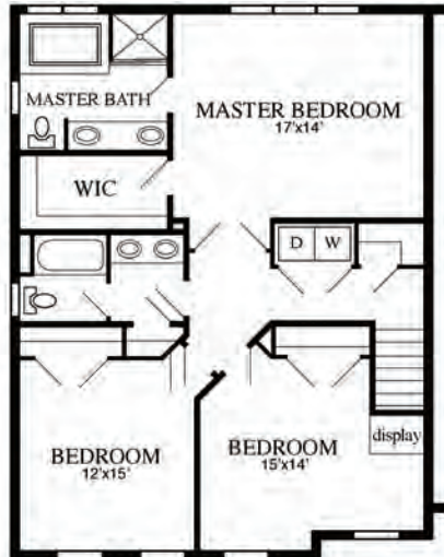
Optional Second Floor