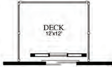
Optional Deck and Doors