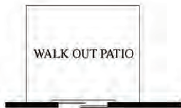
Optional Patio Door